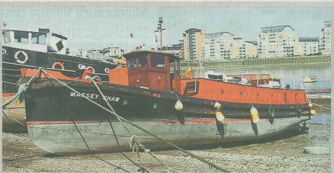
The Massey Shaw on the banks of the Thames, above, patrolling the river, right, and showing off her pumps, below